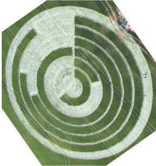
Fig. 1: Manton Drove, nr Marlborough, Wiltshire, 2nd June 2012

We believe the formation reported on 2nd June 2012 resembles a polar clock. It is a kind of clock showing not only the time, but also the date. In order to analyse the message depicted in the formation, we first had to rotate the image (see Fig. 1). After that, we executed the application PolarClock3 (by PixelBreaker). Then we set the date and time so that the polar clock displayed on our monitor screen was the same as the one on the formation.